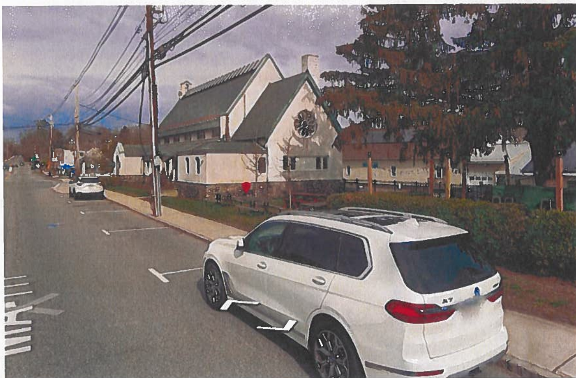
View approaching from Mass. Ave.