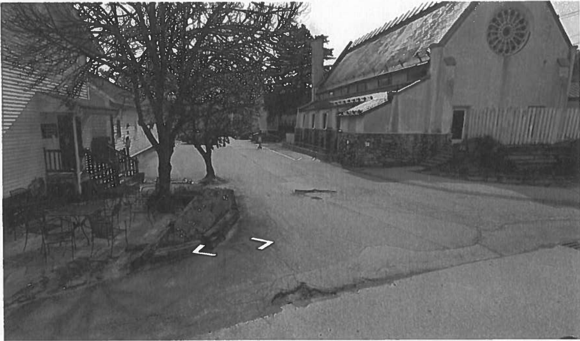
View from Spruce Street