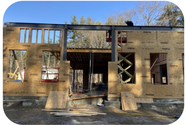
Exterior sheathing installation on south side of building