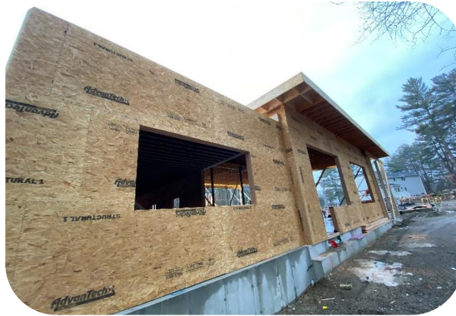
Northeast side of building