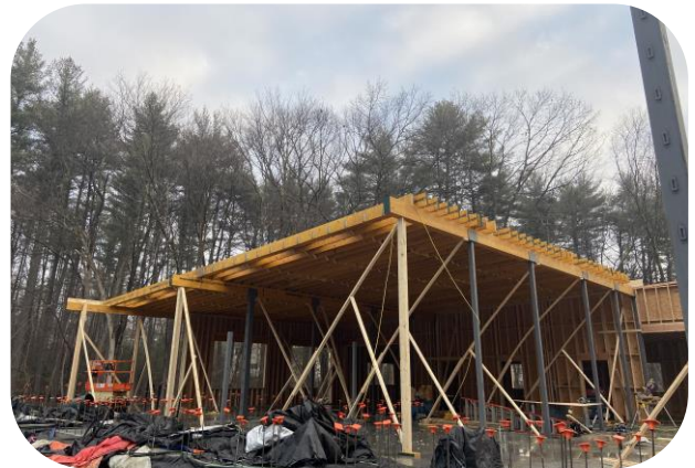
LVL joists installed on east side of building