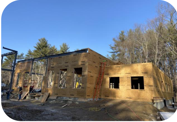
Interior and exterior wood construction on east side of building