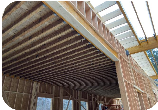
Interior of low roof area on east side of building (01/14/2021)