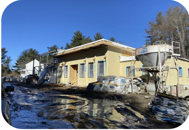
Overview of east side