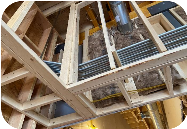
Electrical conduit installed in living area