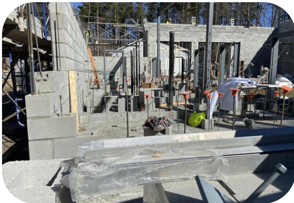
Masonry construction along west side