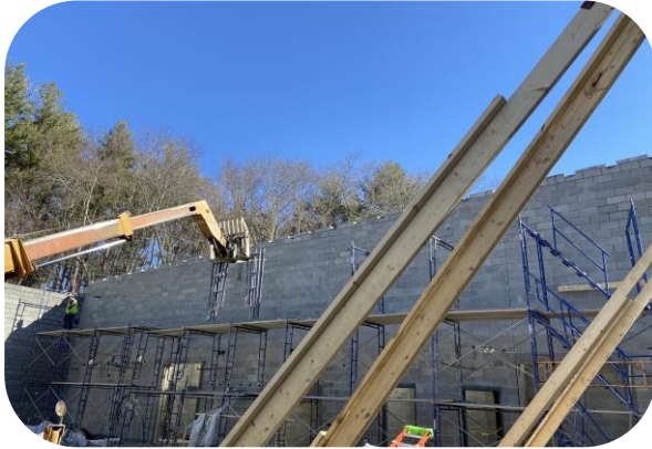
Removing scaffolding along Line 5. Line 5 is complete.