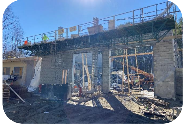
Masonry construction on north side of apparatus bay (looking south)