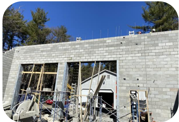
Masonry construction on north side of apparatus bay (looking north)