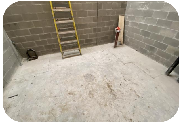
Mechanical pad mark out in mechanical room