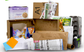
Paper & Cardboard Empty and flatten