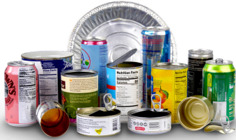
Metal Food & Beverage Cans Empty and rinse