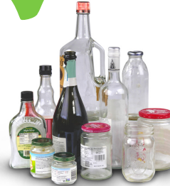
Glass Bottles & Jars Empty and rinse