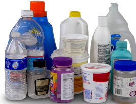
Plastic Bottles, Jars, Jugs & Tubs Empty and replace cap